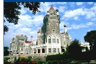
Magnificent Casa Loma Castle in Toronto