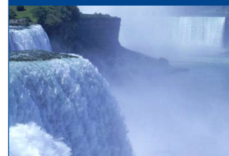
World's most famous Falls