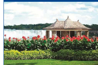
Visit beautiful Queen Victoria Park