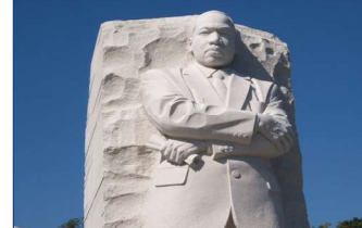
Martin Luther King, Jr. National Memorial