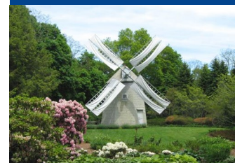
One of Cape Cod's many Windmills

$75 Due Upon Signing. *Price per person, based on double occupancy. Add $190 for single occupancy.