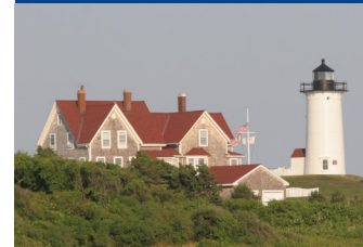
Lighthouse overlooking Vineyard Sound