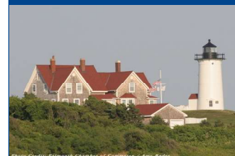
Lighthouse overlooking Vineyard Sound