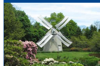
One of Cape Cod's many Windmills